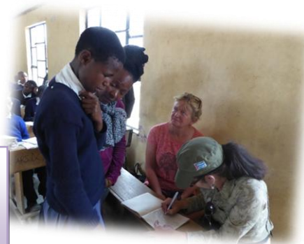
Meserani Juu Primary School