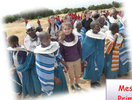
Meserani Chini Primary School

Monday 27 August: Visit Meserani Chini School. Shopping at the Maasai Market, Arusha. Overnight at Meserani Snakepark.