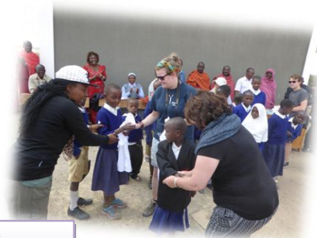
Losingira Primary School

Wednesday 29 August: Visit Losingira Primary School, and interact with some of the pupils in their final year. Final shopping at the Maasai Market, Arusha. Buy a goat at Kisongo Market. Goat barbecue at Meserani Snakepark.. Overnight at Meserani Snakepark.