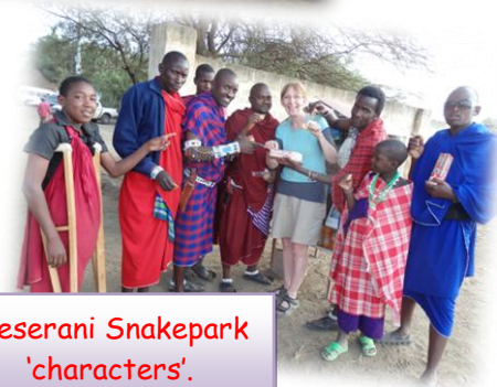
Meserani Snakepark 'characters'.