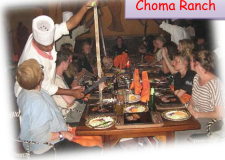
Nyama Choma Ranch