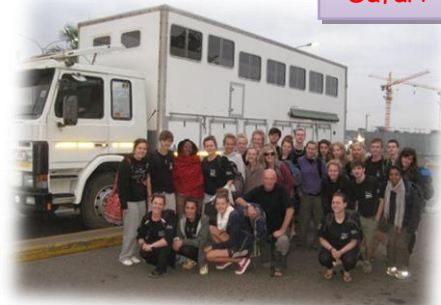
Overland Safari Truck

Overnight at Wildebeest Eco Camp, Nairobi.