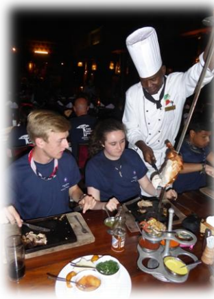
Safari Park Show