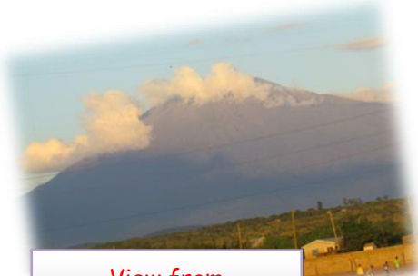
View from Meserani Snakepark