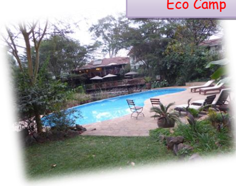
Wednesday 26 August: Drive to Nairobi. Overnight at Wildebeest Eco Camp.